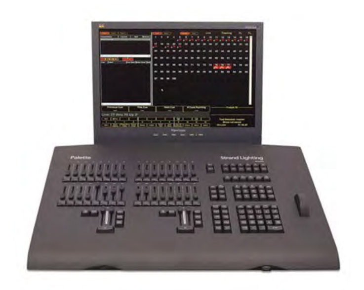
classicPalettell Lighting Control Console

Clean, elegant, and very, very powerful, classic Palette II is a thoroughbred. Starting at 250 channels, classic Palette II can be expanded to 8,000 channels. And with two playbacks and 32 submasters, classic Palette II will eat up complex shows, easily – elegantly.