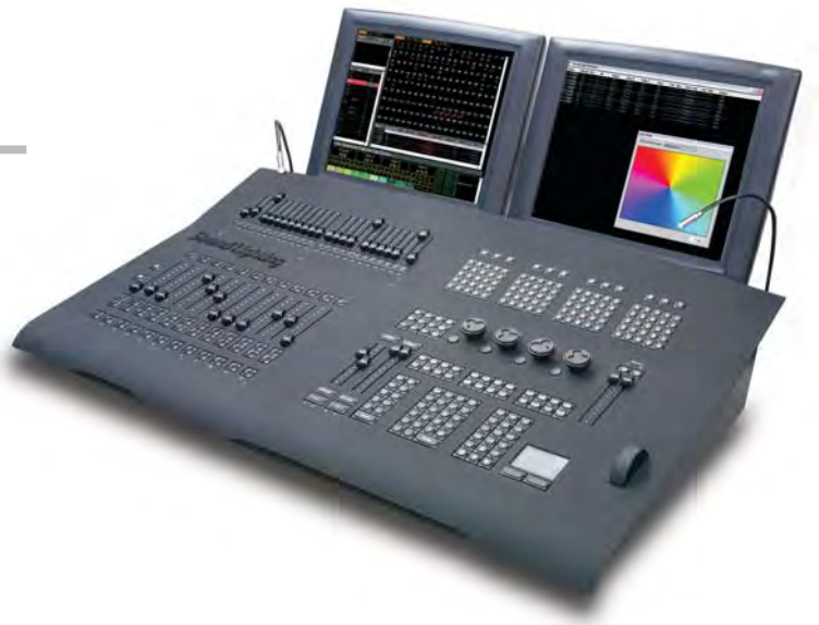
Light Palette VL Lighting Control Console

The Light Palette VL console's moving light effects generator and extensive fixture library mean that you can always get the most out of your moving light rig.