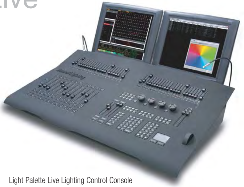
Light Palette Live Lighting Control Console

Light Palette command line operation makes setting up and programming your show a breeze. Intuitive and easy to use, our traditional command structure will be familiar to operators everywhere.